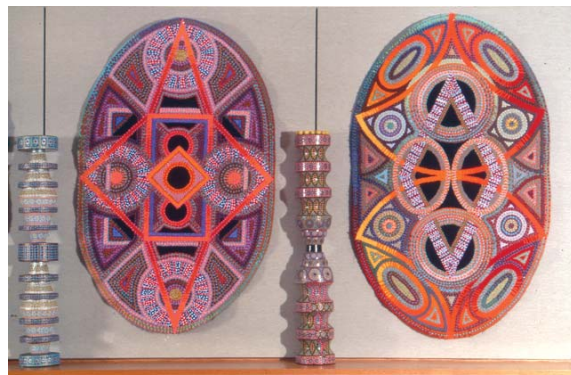
Liz Whitney Quisgard, 2 Ellipses, 2008, Yarn on buckram, 50" x 30" (each); 2 Turnings, 2001, Acrylic on maple, 36" x 8" (each)

ALSO ON VIEW (upper level) - Paintings and sculpture from the Foundation's permanent collection: Works by Ernest Briggs, Seymour Boardman, John Hultberg and others from the 1950s-1980s.